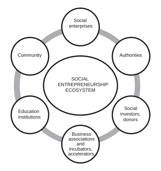
Figure 1. The European social entrepreneurship ecosystem Source: Own elaboration.

The European social entrepreneurship ecosystem includes educational institutions, authorities, social investors, donors, business associations and incubators, accelerators, social enterprises, and communities (Figure 1). Social entrepreneurship in Ukraine is becoming more widespread due, first of all, to its ability to solve socioeconomic problems. However, this type of activity is still quite young, and the ecosystem of social entrepreneurship in Ukraine is not yet fully formed; only social enterprises, incubators, accelerators, and financial institutions are participants. The potential of educational institutions to form competences in the field of social entrepreneurship is not fully realised. Moreover, civil society institutions are insufficiently involved in the development of social entrepreneurship. The development of this economic sector in Ukraine is further hampered by an imperfect regulatory framework, a lack of effective state support mechanisms, insufficient access to investment, and a low level of social participation.